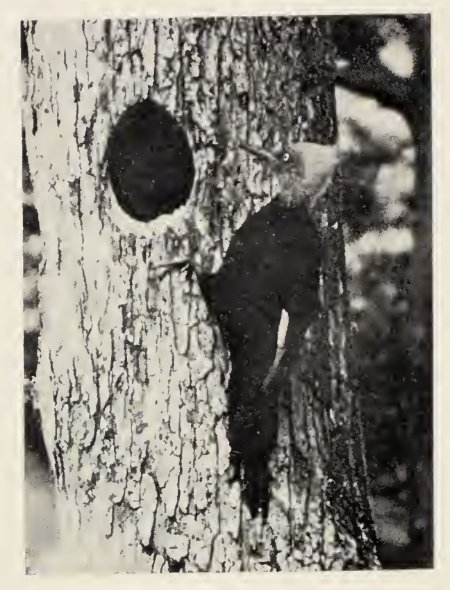
FIG. 1. Male Magellanic Woodpecker at nest cavity 54 kilometers south of San Carlos de Bariloche, Río Negro, near the Río Villegas. (Figs. 1-3 from 16-mm color movies.)